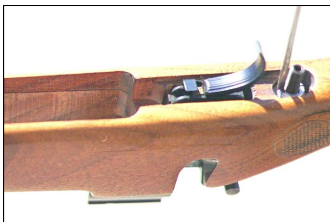
FIG # 5