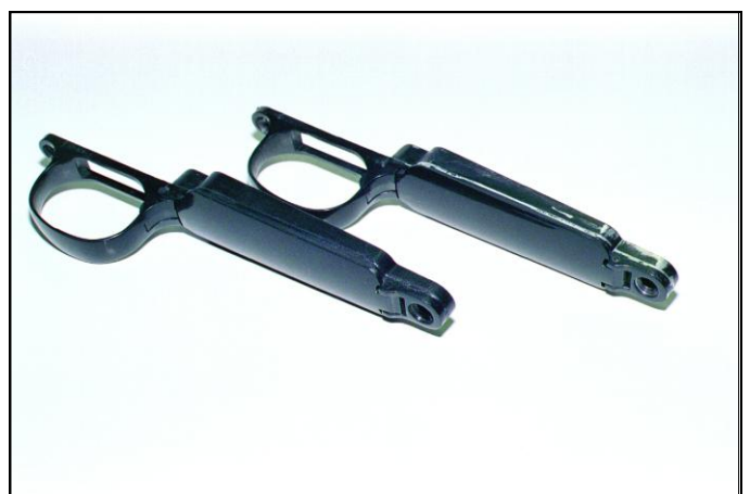
FIG # 6